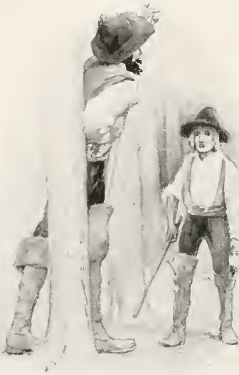
Peter nearly bounded up against a huge giant. (P. 229.)

"Don't lie to me, Charcoal Peter," thundered the giant, "or I will strike you to the earth with my pole. Do you suppose I did not see you begging from the little Glass-man?" Then in milder tones Dutch